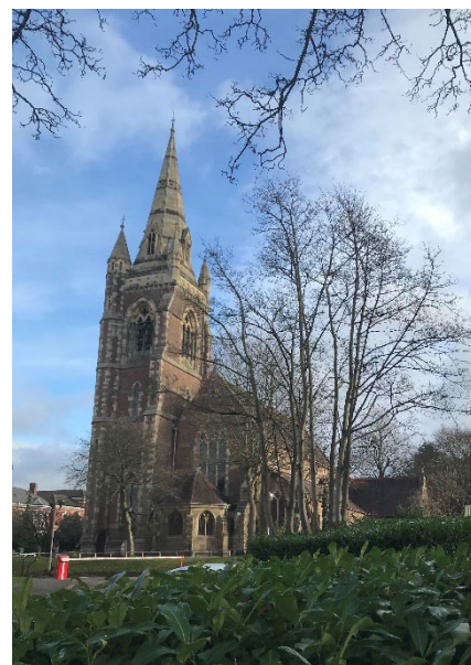
St Anne's Moseley