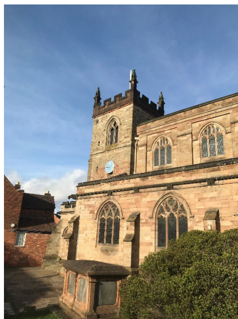
St Mary's Moseley