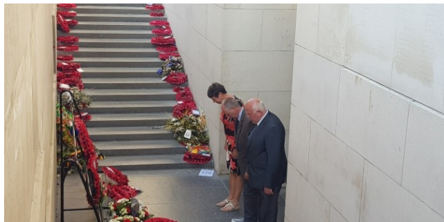
Laying our wreath at the Last Post ceremony