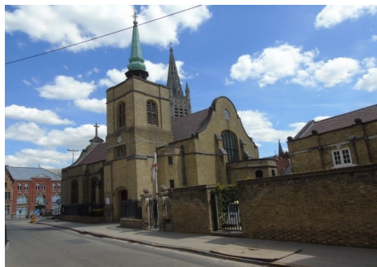
St. George's Memorial Church

displayed on the Memorial to the Missing. It was my first visit to one of the largest War Commission Cemeteries in the world and a very poignant experience to stand among the rows and rows of immaculately tended headstones and remember the young men beneath them, most unidentified.