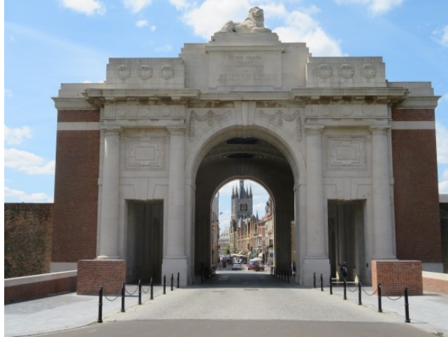
The Menin Gate Memorial

where we left our cars and walked into the centre. We spent the afternoon exploring the town with its beautiful core of medieval and renaissance buildings. The most impressive of these was the magnificent Cloth Hall, actually a complex of buildings, now home to the 'In Flanders Field Museum'. The oldest part of the complex is The Belfry Tower, housing a carillon of 49 bells which sound out sweetly across the