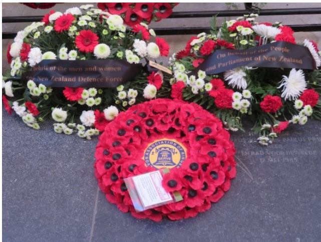
The Devon Association wreath

market square. It is hard to believe that the whole town of Leper, to give it the correct Flemish name, was left totally devastated by the end of the war in 1918 and was incredibly rebuilt stone by stone during the 1920s and 30s, as close to the original architecture as possible. After a lot of walking and a little refreshment, beers all round and waffles and ice-cream for some, soup for others, we headed back to the hotel to get spruced up for the evening ceremony at the Menin Gate Memorial.