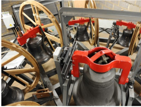
NEW PEAL OF EIGHT IN RADIAL FRAME TOGETHER WITH ELECTRICALLY SWUNG BOURDON AND STATIONARY SERVICE BELL, SOUTH OCKENDON.